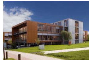
office building in Münster