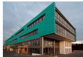
office building in Osnabrück