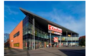
retail store in Meppen