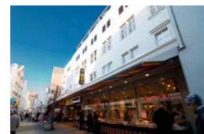
high street object in Herford